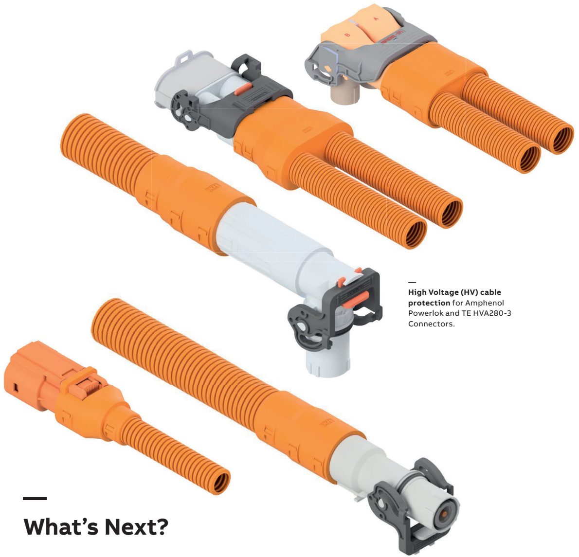
— High Voltage (HV) cable protection for Amphenol Powerlok and TE HVA280-3 Connectors.

— Harnessflex® EVO™ High Voltage Connector Interfaces provide superior mechanical protection. Robust backshell protection on high voltage connectors used in electric ancillaries, DC/DC converters, onboard chargers, high voltage battery packs, hybrid systems, hydrogen fuel cell vehicles, static power systems and more.