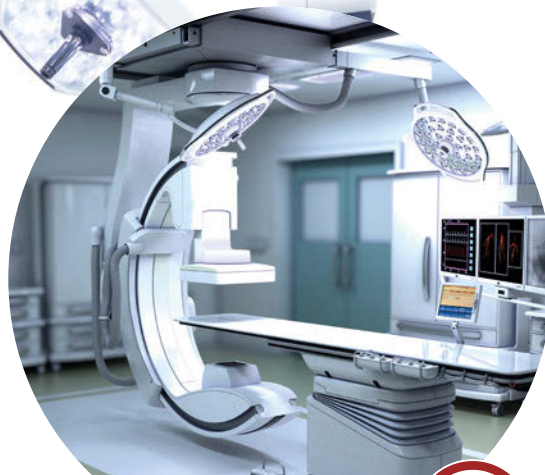
MRT, MEG, CT and x-ray