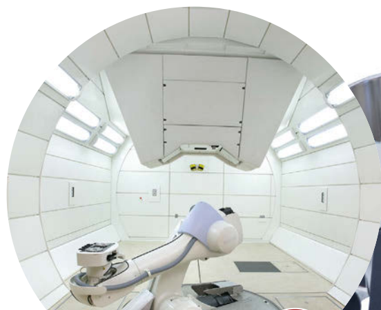
Nuclear medicine and radiotherapy