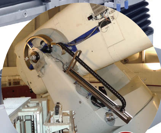
TKR series to avoid vibration