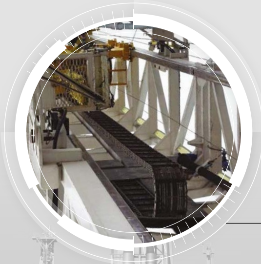
Platform rig module skidding