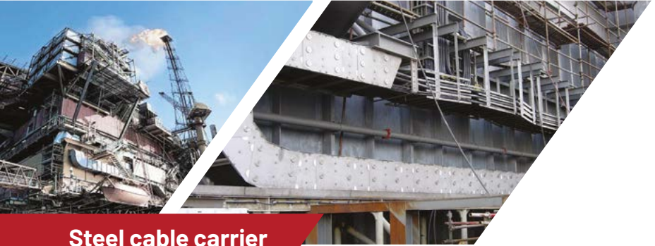
Steel cable carrier installed on an oil platform