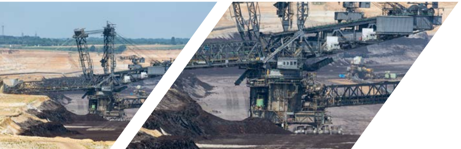
Steel cable carrier in circular application on wide-bucket coal excavator