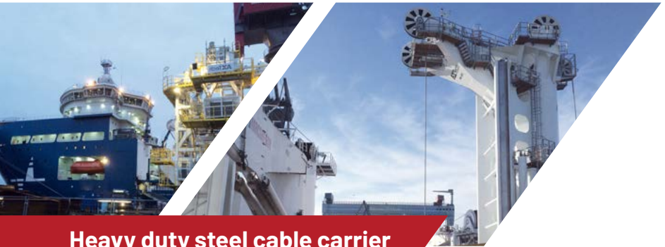
Heavy duty steel cable carrier installed with high pressure hoses on a ship