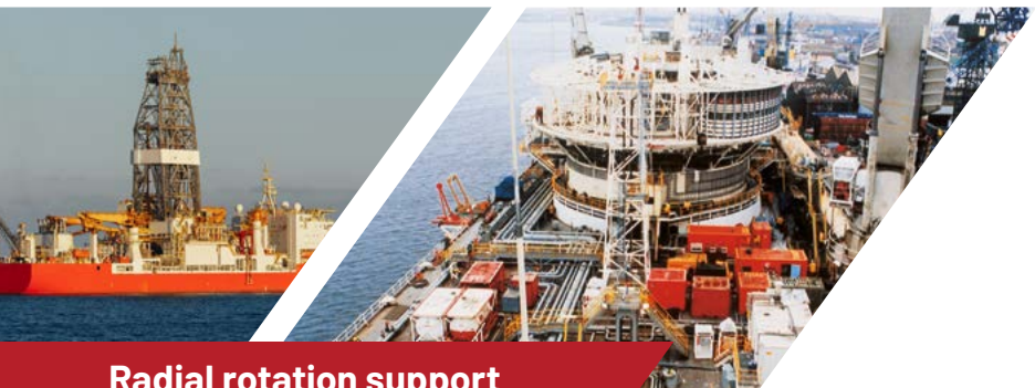
Radial rotation support for big hoses on offshore support vessel