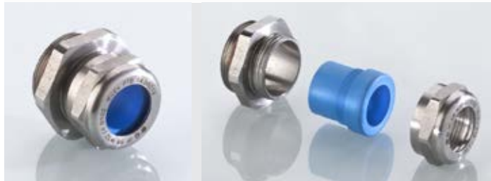
Abb. 1 Fig. 1