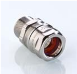
Abb. 1 Fig. 1