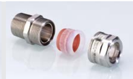
Abb. 2 Fig. 2

Edelstahl Kegeliges NPT-Gewinde ANSI/ASME B1.20.1 Schutzart IP 66, IP 68 (10 bar, 1 Stunde)