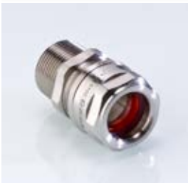
Abb. 1 Fig. 1