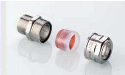
Abb. 2 Fig. 2

Messing vernickelt Kegeliges NPT-Gewinde ANSI/ASME B1.20.1 Schutzart IP 66, IP 68 (10 bar, 1 Stunde)